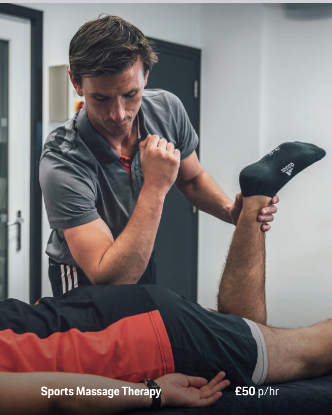
Sports Massage Therapy £50 p/hr